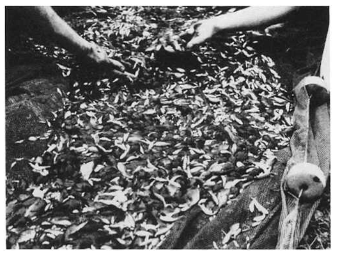
Figure 1. Net haul from a tadpole-infested baitfish production pond. Dark-colored organisms are tadpoles.